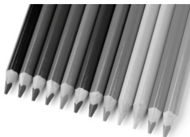
B&W Photo without Filter