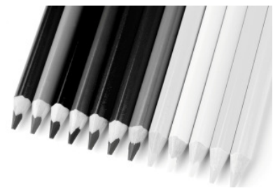
B&W photo with B+W dark red Components of the intrinsic color red become lighter, components of the

Jos. Schneider Optische Werke GmbH Ringstraße 132 55543 Bad Kreuznach Germany Phone +49 671 601-125 Fax +49 671 601-81 – 125 www.schneiderkreuznach.com/fotofilter filter@schneiderkreuznach.com